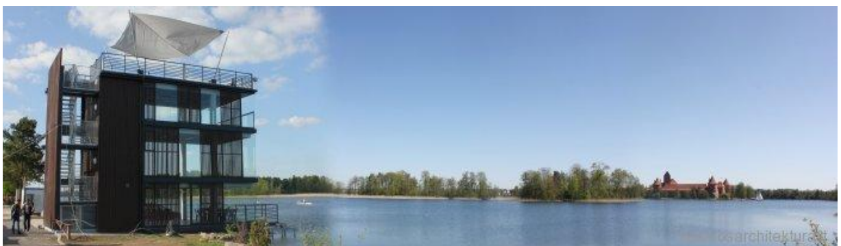
Lithuanian Olympic Sports Centre, Rowing Base Karaimu str. 73, Trakai.